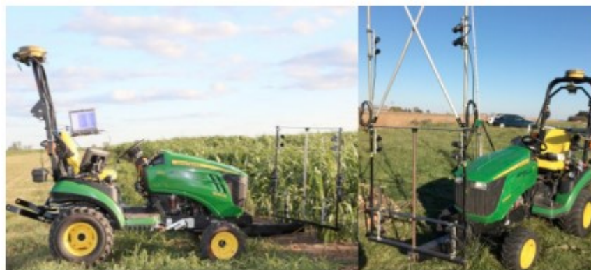
Figure 5. Phenotyping robot without and with extension rig [20].

Artificial vision can not only be used to guide the vehicle along a defined path. For example, in Bao and Tang [20], it is mentioned that they worked with a self-guided tractor that navigates between the rows of crops; While doing the trajectory, it collects stereo images of sorghum samples as shown in Figure 5. The images are processed offline, with a semi-automated software interface the stem diameter is measured, as well as the height of the plant, the leaf area index (LAI) and vegetation volume index (VVI). It is mentioned that very similar results were obtained compared to the normal measurement.