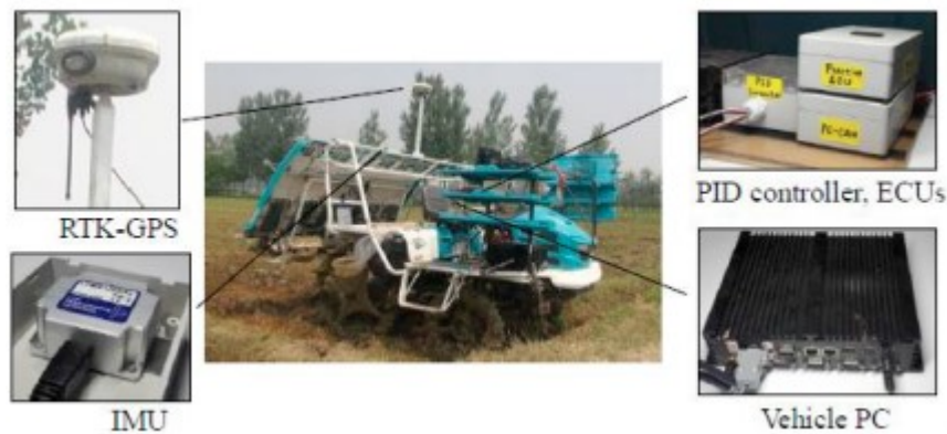
Figure 7. The automatically guided rice transplanted [32].

The IMU sensors are the main complement of the guidance systems through RTK-GPS, through these we can know the orientation of the robot, even more specialized sensors have the absolute position as an output, with this we can know the position with respect to a frame global and with which the RTK-GPS are oriented in the same way; Knowing this data is of the utmost importance if you want to know the phase shift between the reference point or path and the position of the tractor robot. The work done by Xiang et al. [32] presents the development of a machine to automatically transplant rice as shown in Figure 6, for this purpose different sensors and actuators were used, including RTK-GPS and IMU as a positioning and orientation system. The use of these sensors for guidance has a lateral error that ranges between 1 and 20 cm depending on various factors mentioned above.