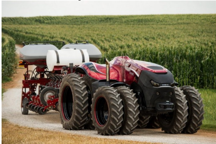
Figure 1. Case IH autonomous tractor [7].

on-board sensors and video cameras, the tractor can identify obstacles and dodge them easily, in addition to the autonomous system, establishing the most efficient route according to the terrain and obstacles.