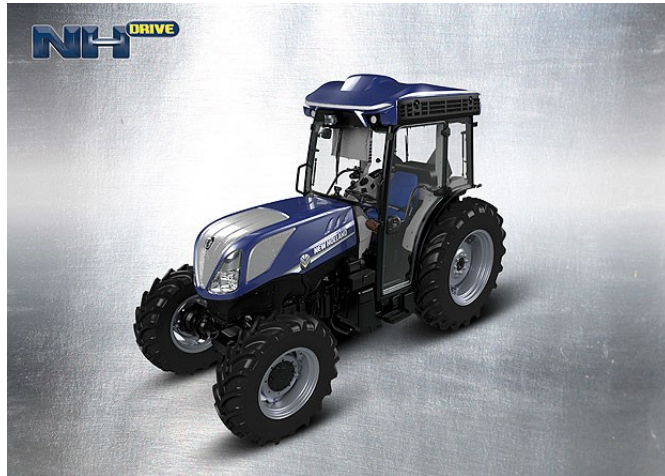
Figure 3. NHDrive, autonomous tractor New Holland [11].

Yanmar tractor producer, presented its autonomous tractor in 2018 Fig. 4, in Yanmar [4] it is mentioned that the developments are part of the project called Yanmar Robot Tractor. It works with SmartPilot technology (it is the brand of product lines that incorporate Yanmar autonomous driving technology [4]), which uses precision positioning data and robotic autonomous driving technology [12]. The system allows a single driver to operate two tractors in coordination (a tractor robot and the tractor manually manipulated by the operator).