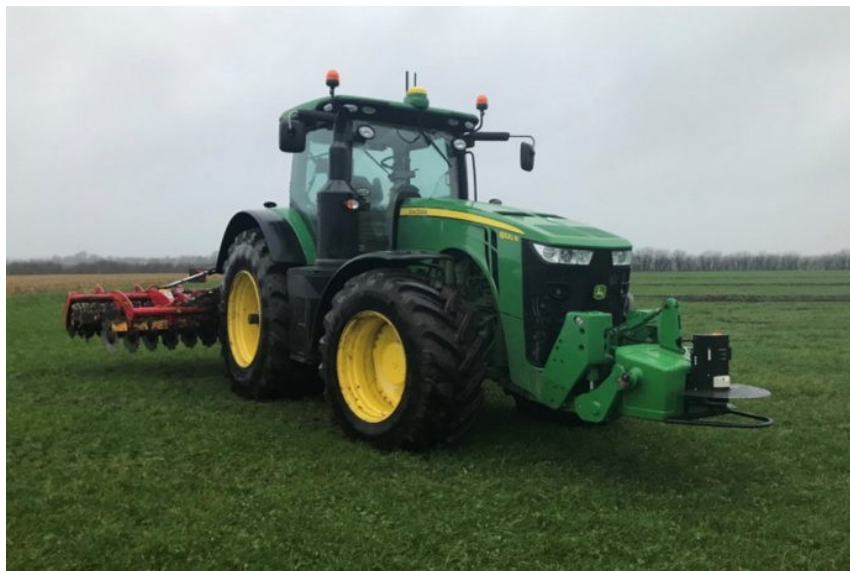
Figure 2. John Deere 8320R Tractor [9].

The John Deere company in 2017 presented its autonomous tractor, the 8320R model shown in Figure 2, which was put on the market in Denmark [8]. John Deere autonomous models have a system called "AutoTrac Controller", this system is what allows the autonomy of the tractor and can even be adapted to non-brand tractors with the autonomous Plug and Play kit [8]. This kit has a laser scanner that allows you to detect obstacles up to a maximum distance of 100 meters.