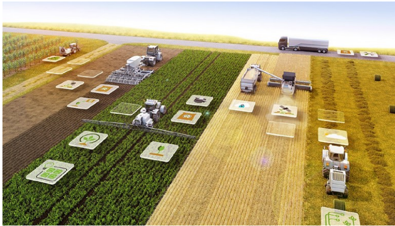
Figure 8. Robot farming system [39].

A sensor unit that is successful in detecting an obstacle is the 2D scanning laser, in the literature Noguchi and Barawid [40] has been described for a tractor robot. Since it is necessary to equip the robot with redundant and multi-stage safety systems, three types of obstacle detection sensors are implemented in the robot tractor. Figure 9 shows a 2D laser scanner connected to the front of the robot tractor. The laser scanner is a non-contact measurement system (NCMS), which can scan your environment with two-dimensional measurements of the distance and angle of the object with respect to the direction of transmission that is counterclockwise.