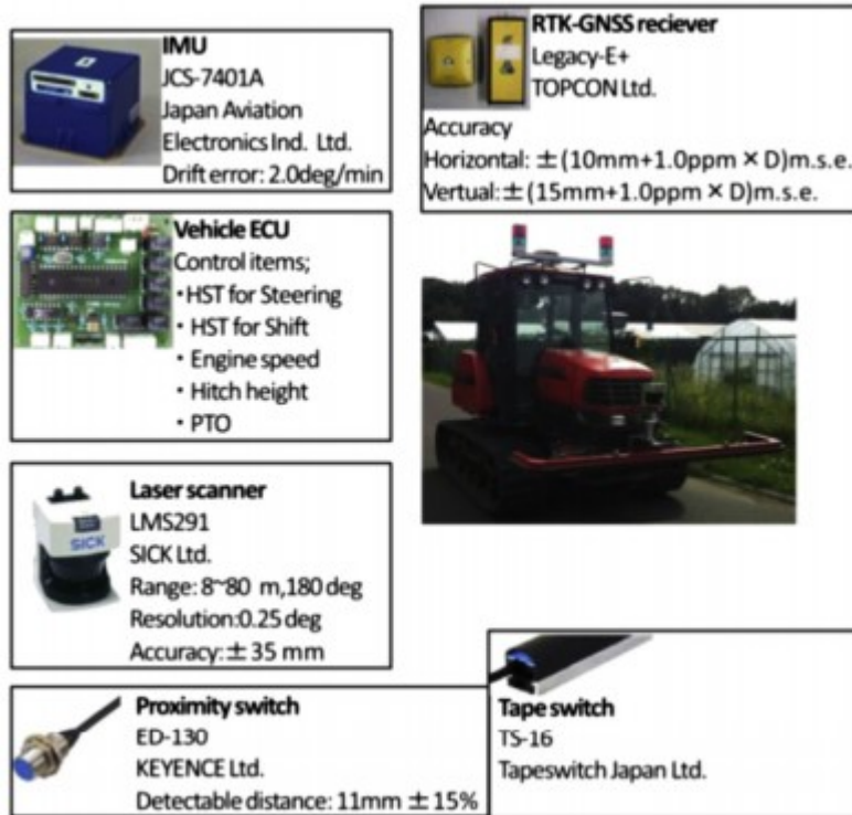
Figure 7. The hardware of the robot tractor [29].

Safety is a mandatory factor to consider when developing a product, agriculture is no exception, in the work done by Noguchi [5] there is the talk of a problem that has not been resolved in this area. Ensuring safety for both the operator and the robot's operating space is indispensable. In the USA especially awareness about security is extremely high. All standard tractors have safety mechanisms that prevent the vehicle from moving forward if the operator is not sitting in the seat. For these reasons, an autonomous vehicle, as it does not have an operator, must have a higher level of safety to guarantee its correct operation in the event of a failure, with a large number of sensors as shown in Figure 7.