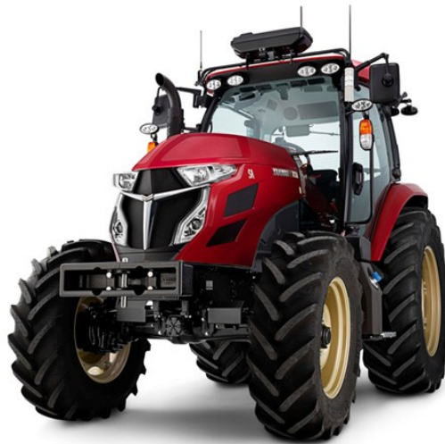
Figure 4. Robot tractor YANMAR [13].

Yanmar tractor producer, presented its autonomous tractor in 2018 Fig. 4, in Yanmar [4] it is mentioned that the developments are part of the project called Yanmar Robot Tractor. It works with SmartPilot technology (it is the brand of product lines that incorporate Yanmar autonomous driving technology [4]), which uses precision positioning data and robotic autonomous driving technology [12]. The system allows a single driver to operate two tractors in coordination (a tractor robot and the tractor manually manipulated by the operator).