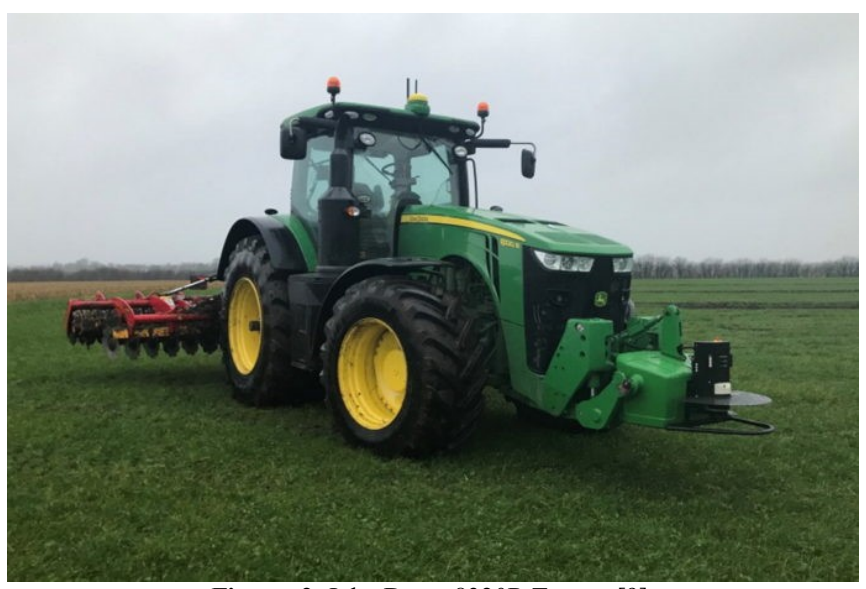
Figure 2. John Deere 8320R Tractor [9].

The John Deere company in 2017 presented its autonomous tractor, the 8320R model shown in Figure 2, which was put on the market in Denmark [8]. John Deere autonomous models have a system called "AutoTrac Controller", this system is what allows the autonomy of the tractor and can even be adapted to non-brand tractors with the autonomous Plug and Play kit [8]. This kit has a laser scanner that allows you to detect obstacles up to a maximum distance of 100 meters.