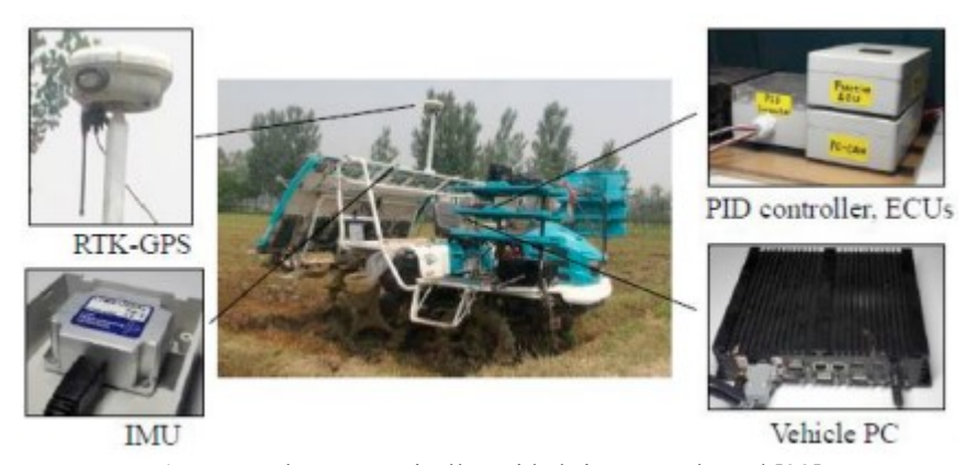
Figure 7. The automatically guided rice transplanted [32].

The IMU sensors are the main complement of the guidance systems through RTK-GPS, through these we can know the orientation of the robot, even more specialized sensors have the absolute position as an output, with this we can know the position with respect to a frame global and with which the RTK-GPS are oriented in the same way; Knowing this data is of the utmost importance if you want to know the phase shift between the reference point or path and the position of the tractor robot. The work done by Xiang et al. [32] presents the development of a machine to automatically transplant rice as shown in Figure 6, for this purpose different sensors and actuators were used, including RTK-GPS and IMU as a positioning and orientation system. The use of these sensors for guidance has a lateral error that ranges between 1 and 20 cm depending on various factors mentioned above.