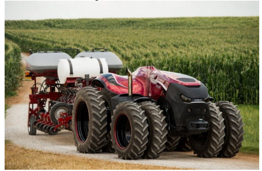
Figure 1. Case IH autonomous tractor [7].

on-board sensors and video cameras, the tractor can identify obstacles and dodge them easily, in addition to the autonomous system, establishing the most efficient route according to the terrain and obstacles.