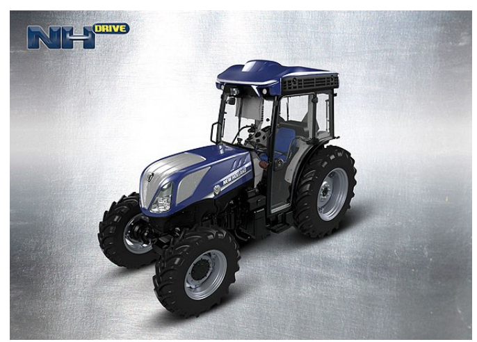
Figure 3. NHDrive, autonomous tractor New Holland [11].

Yanmar tractor producer, presented its autonomous tractor in 2018 Fig. 4, in Yanmar [4] it is mentioned that the developments are part of the project called Yanmar Robot Tractor. It works with SmartPilot technology (it is the brand of product lines that incorporate Yanmar autonomous driving technology [4]), which uses precision positioning data and robotic autonomous driving technology [12]. The system allows a single driver to operate two tractors in coordination (a tractor robot and the tractor manually manipulated by the operator).