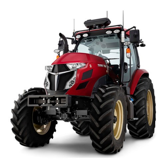
Figure 4. Robot tractor YANMAR [13].

Yanmar tractor producer, presented its autonomous tractor in 2018 Fig. 4, in Yanmar [4] it is mentioned that the developments are part of the project called Yanmar Robot Tractor. It works with SmartPilot technology (it is the brand of product lines that incorporate Yanmar autonomous driving technology [4]), which uses precision positioning data and robotic autonomous driving technology [12]. The system allows a single driver to operate two tractors in coordination (a tractor robot and the tractor manually manipulated by the operator).