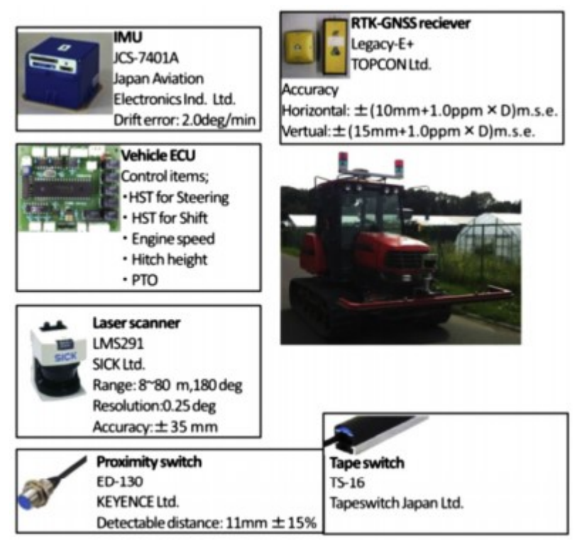
Figure 7. The hardware of the robot tractor [29].

Safety is a mandatory factor to consider when developing a product, agriculture is no exception, in the work done by Noguchi [5] there is the talk of a problem that has not been resolved in this area. Ensuring safety for both the operator and the robot's operating space is indispensable. In the USA especially awareness about security is extremely high. All standard tractors have safety mechanisms that prevent the vehicle from moving forward if the operator is not sitting in the seat. For these reasons, an autonomous vehicle, as it does not have an operator, must have a higher level of safety to guarantee its correct operation in the event of a failure, with a large number of sensors as shown in Figure 7.