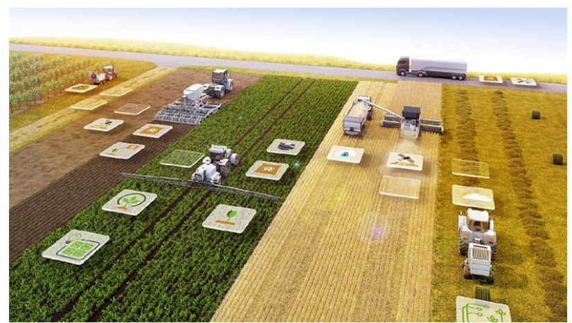
Figure 8. Robot farming system [39].

A sensor unit that is successful in detecting an obstacle is the 2D scanning laser, in the literature Noguchi and Barawid [40] has been described for a tractor robot. Since it is necessary to equip the robot with redundant and multi-stage safety systems, three types of obstacle detection sensors are implemented in the robot tractor. Figure 9 shows a 2D laser scanner connected to the front of the robot tractor. The laser scanner is a non-contact measurement system (NCMS), which can scan your environment with two-dimensional measurements of the distance and angle of the object with respect to the direction of transmission that is counterclockwise.