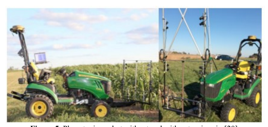
Figure 5. Phenotyping robot without and with extension rig [20].

Artificial vision can not only be used to guide the vehicle along a defined path. For example, in Bao and Tang [20], it is mentioned that they worked with a self-guided tractor that navigates between the rows of crops; While doing the trajectory, it collects stereo images of sorghum samples as shown in Figure 5. The images are processed offline, with a semi-automated software interface the stem diameter is measured, as well as the height of the plant, the leaf area index (LAI) and vegetation volume index (VVI). It is mentioned that very similar results were obtained compared to the normal measurement.